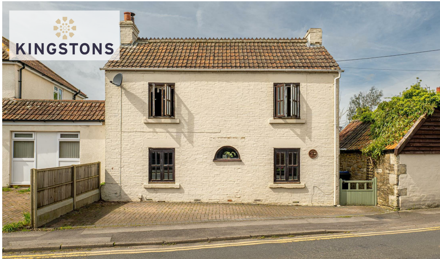
Church Lane , Melksham SN12 7EE